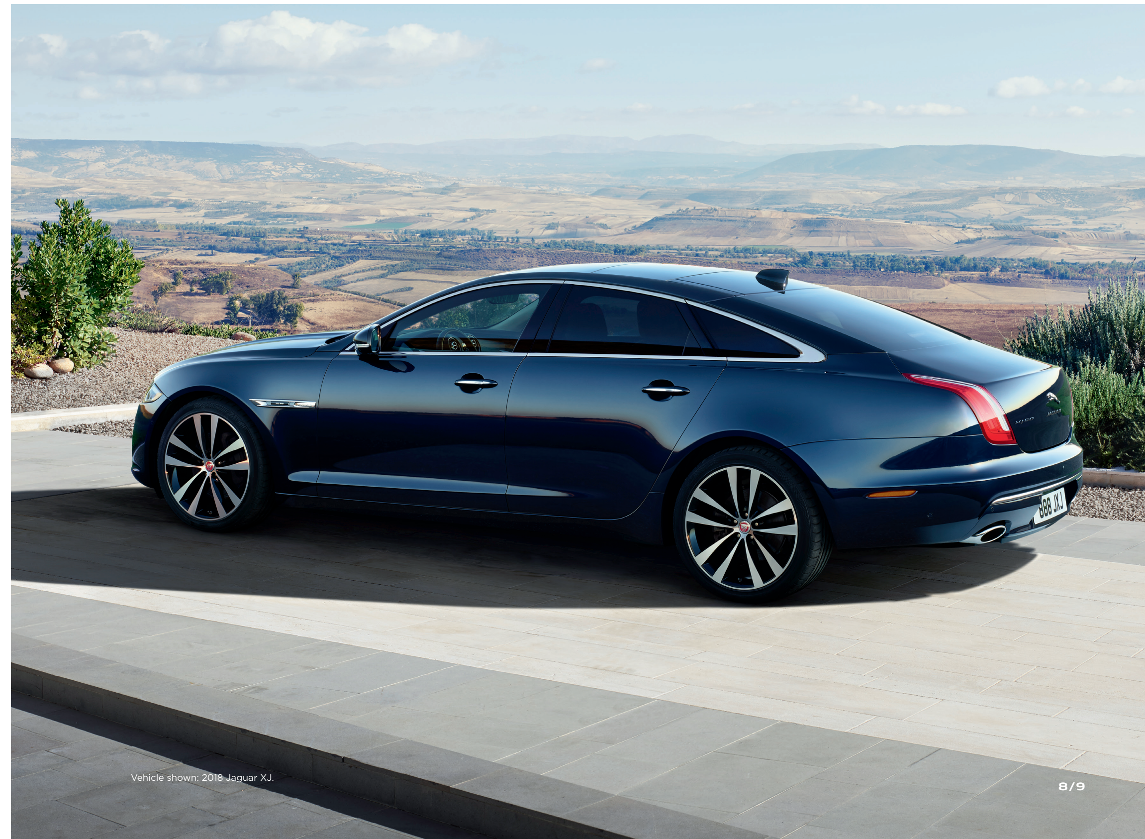
Vehicle shown: 2018 Jaguar XJ.

*See your local Jaguar Authorized Retailer for complete details.