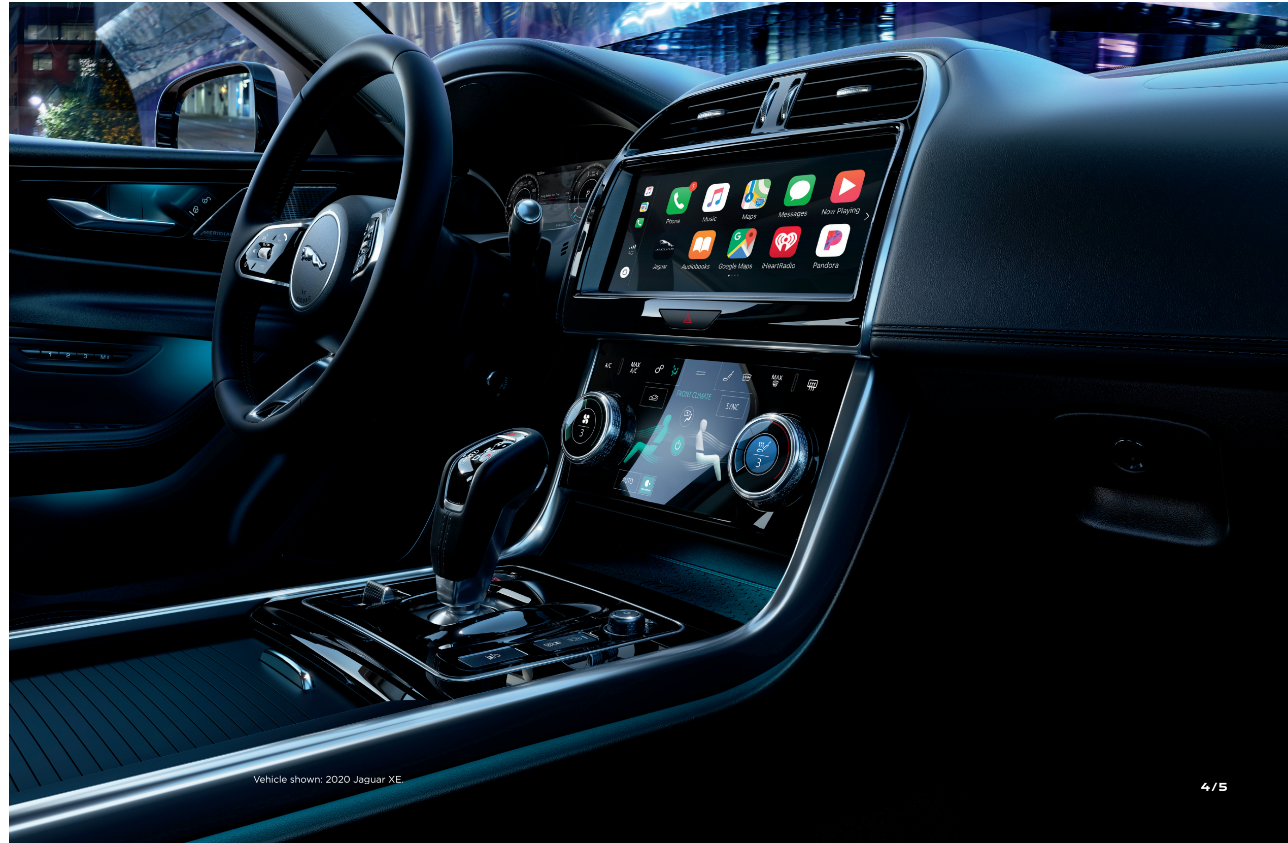
Vehicle shown: 2020 Jaguar XE.