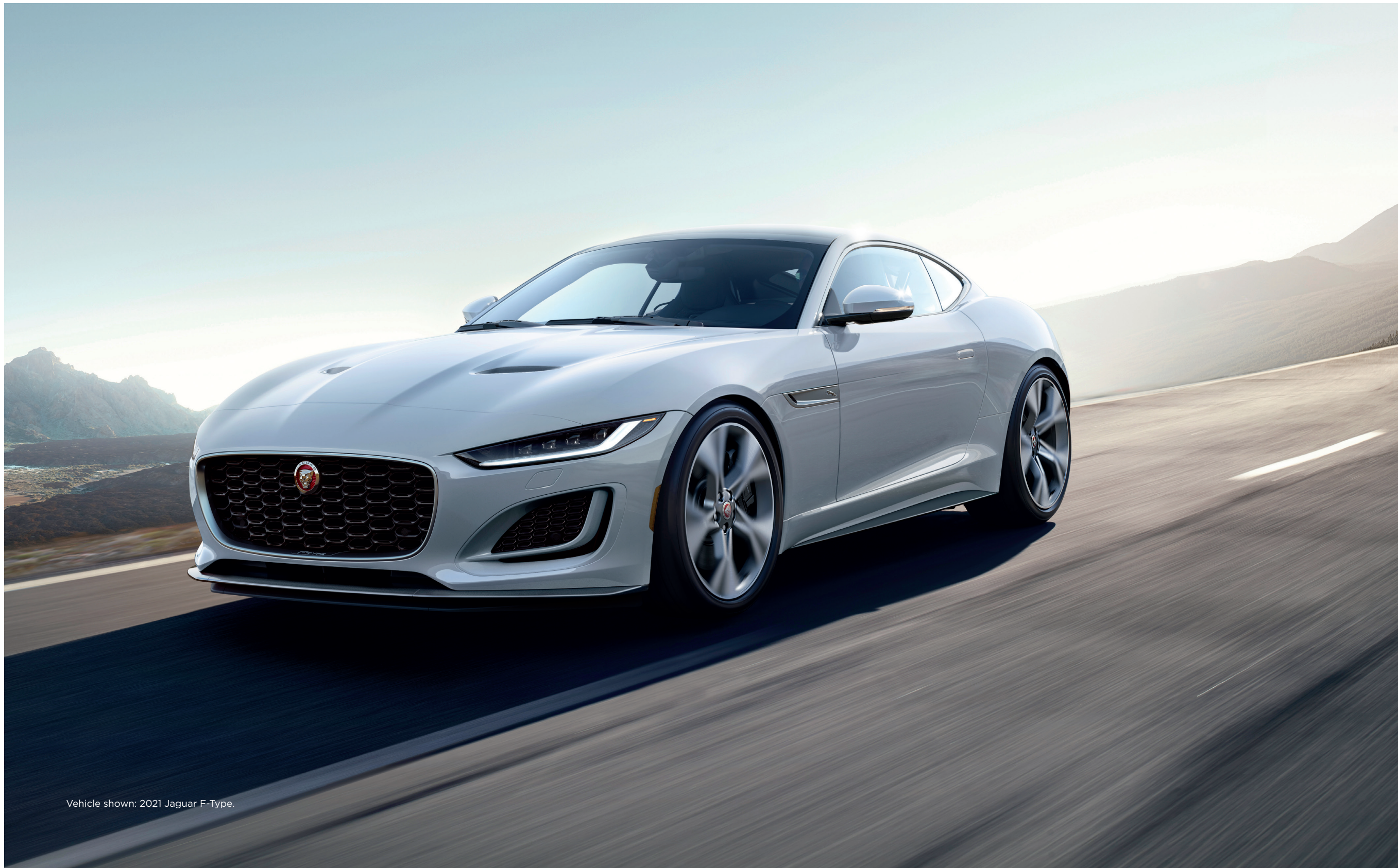
Vehicle shown: 2021 Jaguar F-Type.