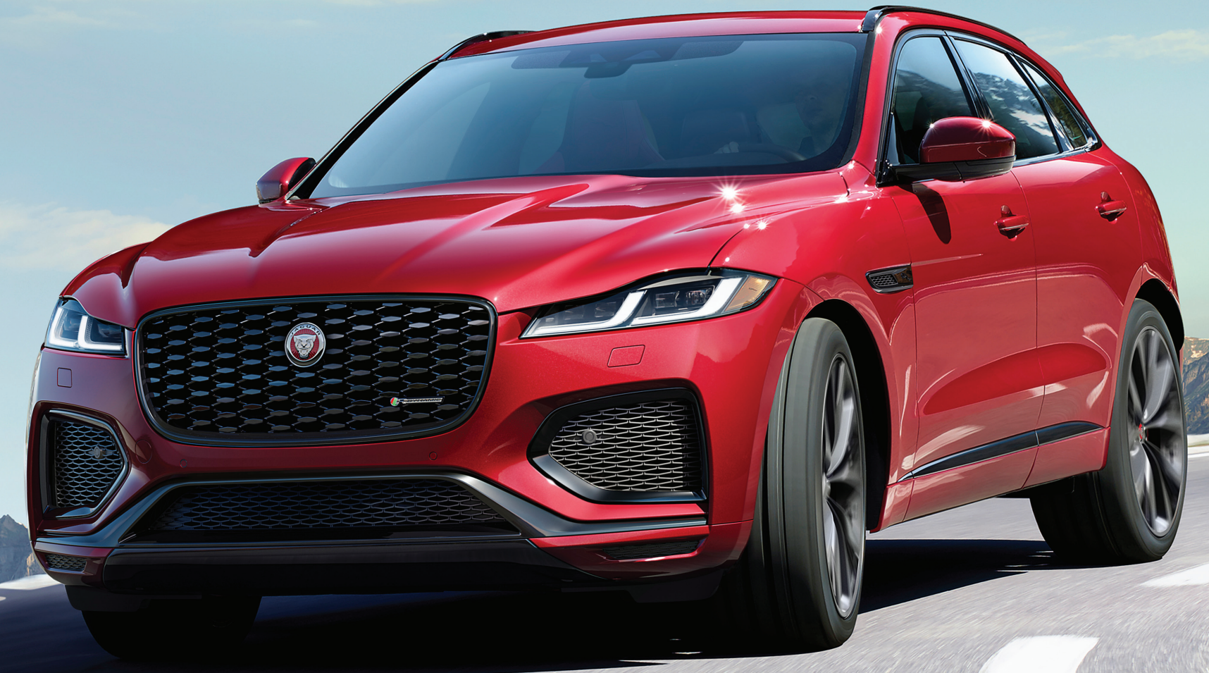
Vehicle shown: 2021 Jaguar F-PACE.