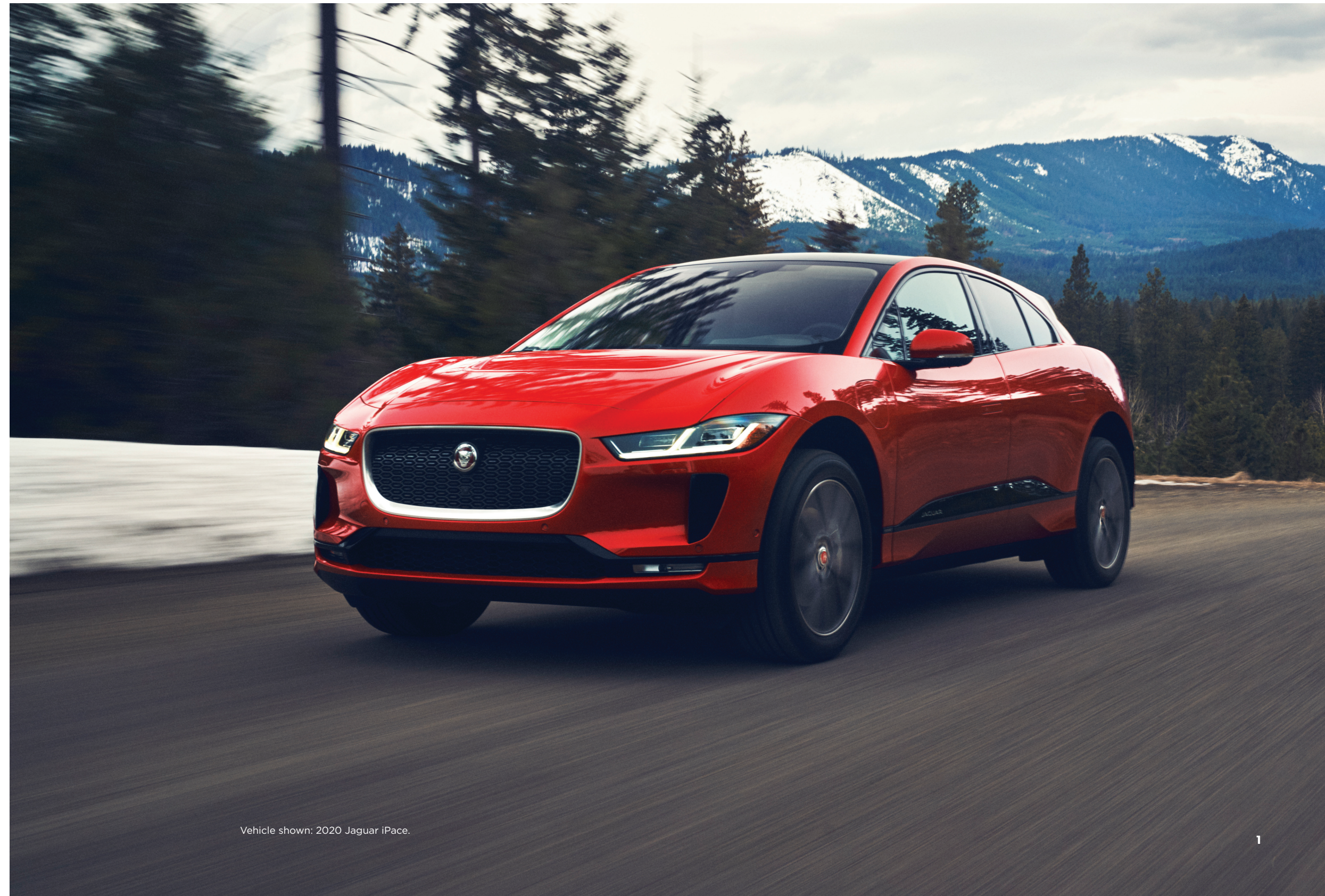
Vehicle shown: 2020 Jaguar iPace.