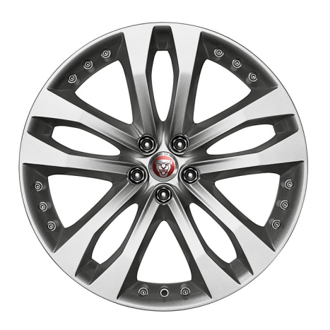
20" Style 5039, 5 split-spoke