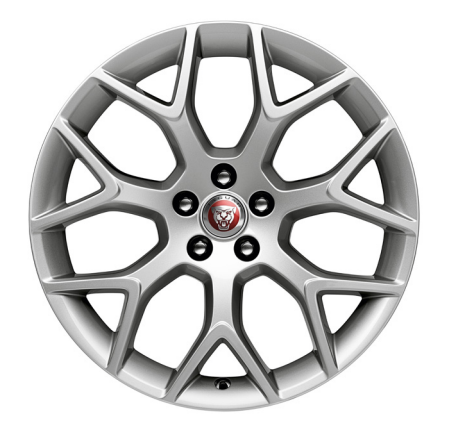
19" Style 7013, 7 split-spoke