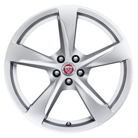
20″ Style 5042, 5 spoke, Forged, Carbon Fibre and Satin Dark Grey Diamond Turned finish