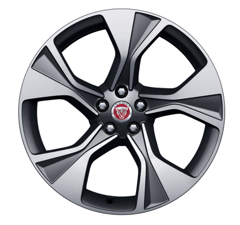
20″ Style 5102, 5 spoke, Technical Grey Diamond Turned finish