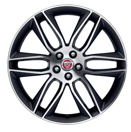
20″ Style 6003, 6 split-spoke, Dark Grey Diamond Turned finish