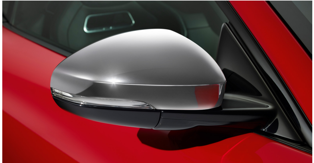
Chrome Mirror Covers

High grade Carbon Fibre mirror covers provide a performance-inspired styling upgrade.