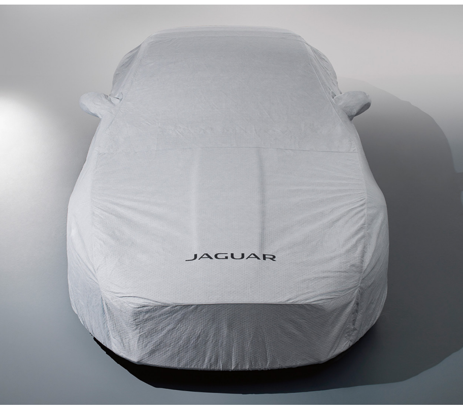
All-Weather Car Cover

Simple to fit and remove, the wind deflector reduces air draft and turbulence in the passenger compartment, even at high speeds. Supplied with a Jaguar branded storage bag.