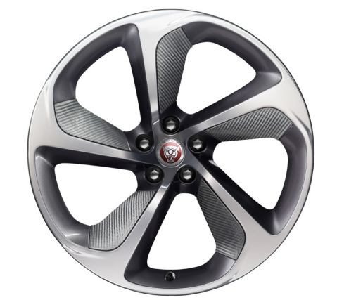
20" Style 5062, Forged, 5 spoke, Carbon Fibre Silver Weave