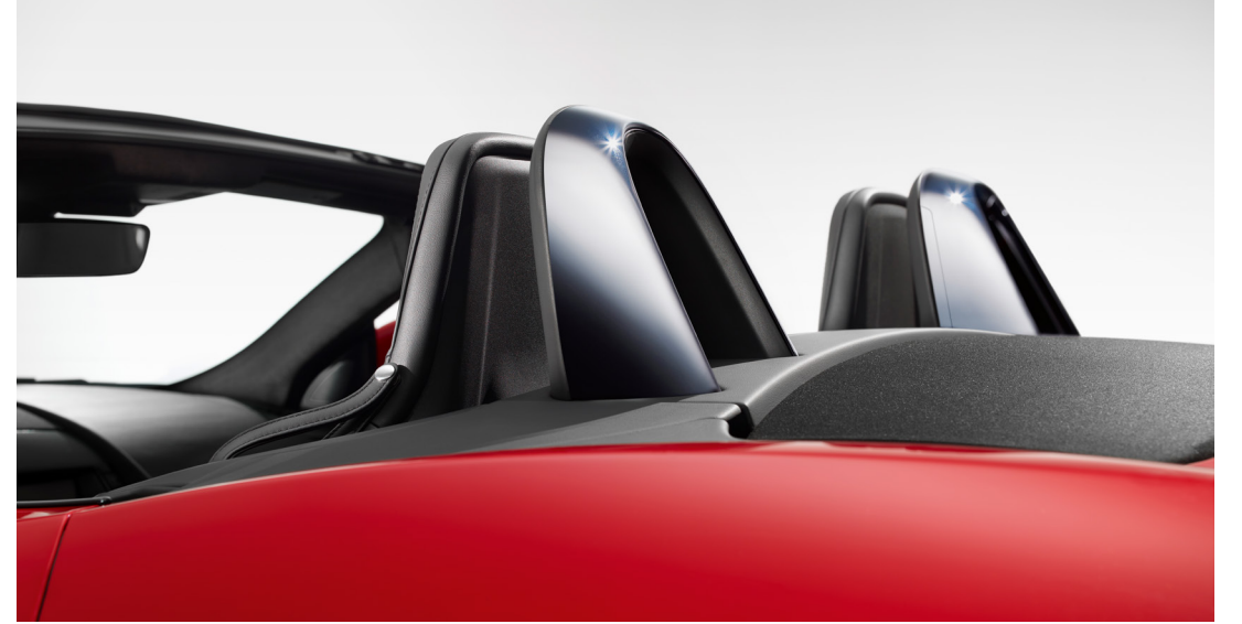
Chrome Roll Hoops

High grade Carbon Fibre roll hoops featuring a 2x2 twill weave and a High Gloss lacquered finish provide a performance-inspired styling enhancement coupled with weight benefits associated with carbon fibre.