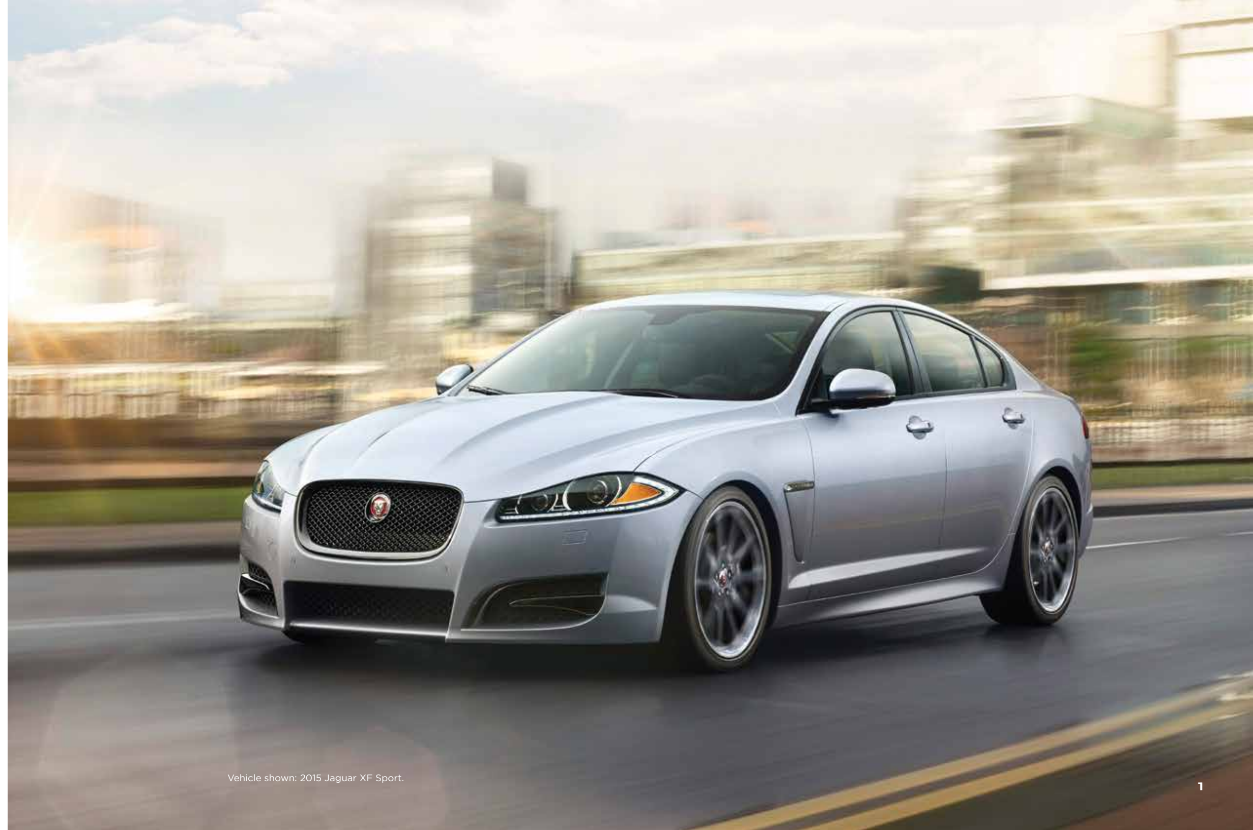
Vehicle shown: 2015 Jaguar XF Sport.