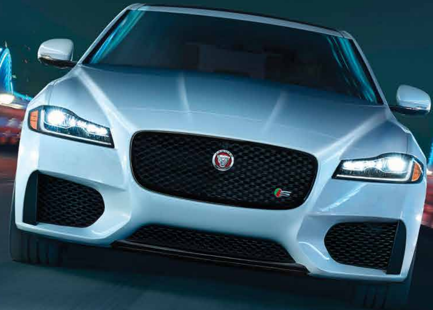
Vehicle shown: 2016 Jaguar XF S.

Already have a particular Jaguar vehicle in mind? With the Approved Certified Pre-Owned Inventory Search, at www.JaguarUSA.com , you can enter the exact model, year, price preference and mileage range you desire. You can even find out what models are currently in your local Jaguar Retailer's inventory.