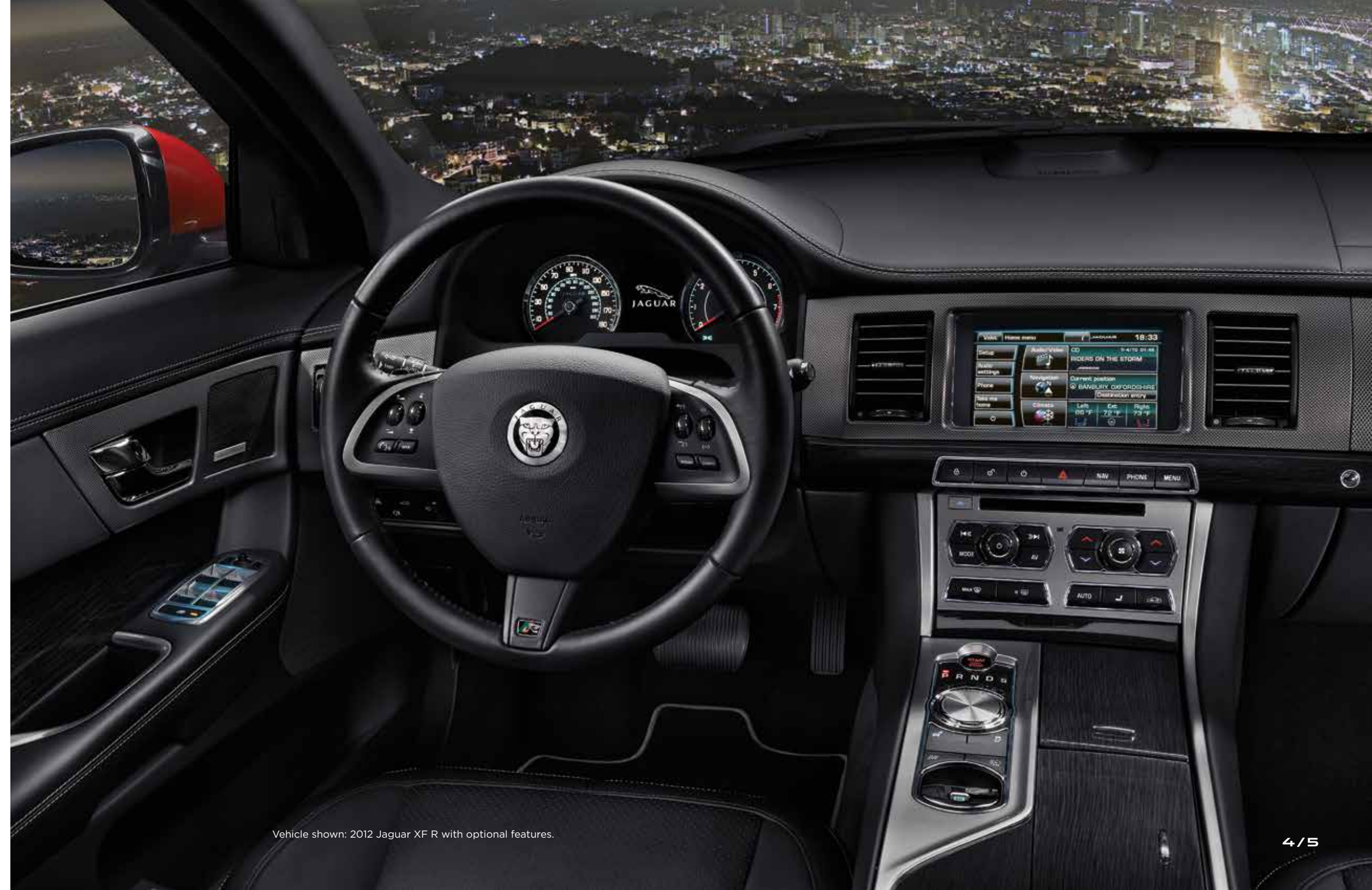
Vehicle shown: 2012 Jaguar XF R with optional features.