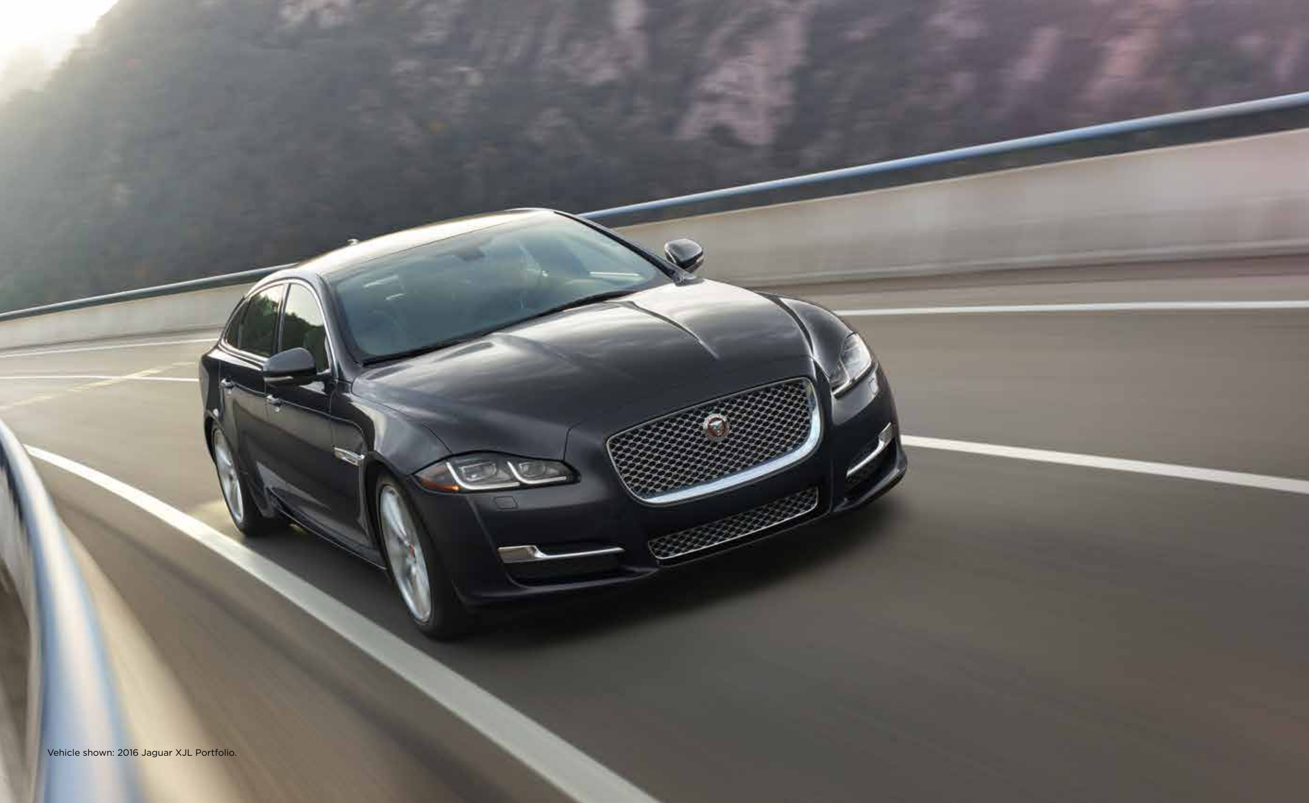
Vehicle shown: 2016 Jaguar XJL Portfolio.